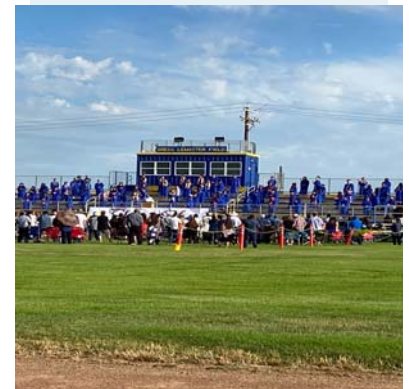
Graduation Event at Pierce HS on new Stadium Bleachers (May 29, 2020).

Photographs of Current Projects Measure B Project Matrix Schedule