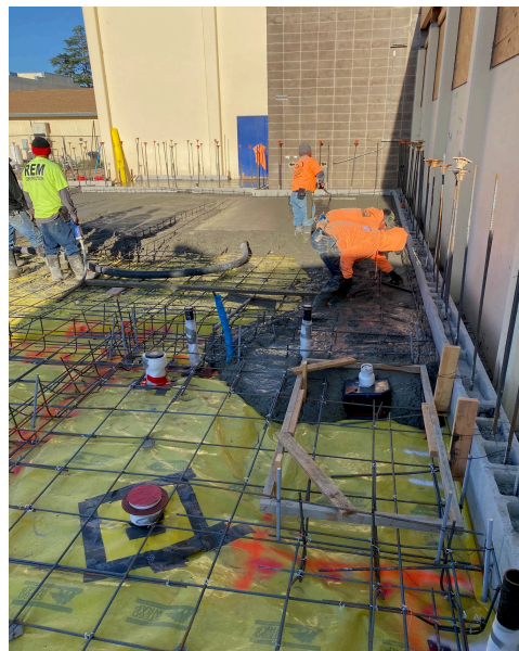
New Concrete being placed by Contractor at new Girl's Locker Room

Work continues on the Pierce HS Locker Room Modernization and expansion. The original South Gym building was constructed in 1965 and only housed the boys locker room facility (the girls were located in the North Gym - circa 1937). The project scope includes the full renovation of the boy's side locker room space, updating showers, restrooms, storage areas and coaches facilities. The expansion portion adds 2,500 SQ FT. of new space for girls use, matching footprint of the boy's side which brings the entire gym to be Title 9 compliant. The new addition is constructed with cement masonry units (CMU) to add durability and longevity for the space.