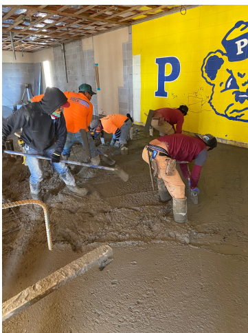
New Concrete being placed by Contractor at modernized Boy's Locker Room

Work continues on the Pierce HS Locker Room Modernization and expansion. The original South Gym building was constructed in 1965 and only housed the boys locker room facility (the girls were located in the North Gym - circa 1937). The project scope includes the full renovation of the boy's side locker room space, updating showers, restrooms, storage areas and coaches facilities. The expansion portion adds 2,500 SQ FT. of new space for girls use, matching footprint of the boy's side which brings the entire gym to be Title 9 compliant. The new addition is constructed with cement masonry units (CMU) to add durability and longevity for the space.